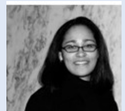
NPC NYS 2

Just like any other business, nonprofits must develop a plan on how to operate during today's economic realities. To address what is proving to be a difficult 2010, nonprofits should consider the following when developing a contingency plan.