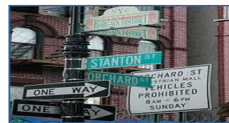
Lower East Side Mobile Workshop: Creative Mission Financing