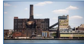
Brooklyn Mobile Workshop: Adjusting for Community Need